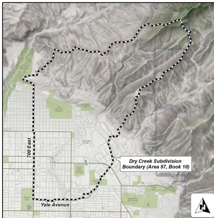
Figure 1: Dry Creek Subdivision Boundary

A search of our records indicates that you may be an owner (or owner's agent/legal counsel) of property or a water right within the boundary of the Dry Creek Subdivision. The Dry Creek Subdivision covers the area associated with the natural hydrologic drainage of Dry Creek, including a portion of urban Salt Lake City bounded on the south by Yale Avenue, on the east by the Red Butte Creek drainage, on the west by 700 East, and on the north by the City Creek drainage. (see Figure 1 below).