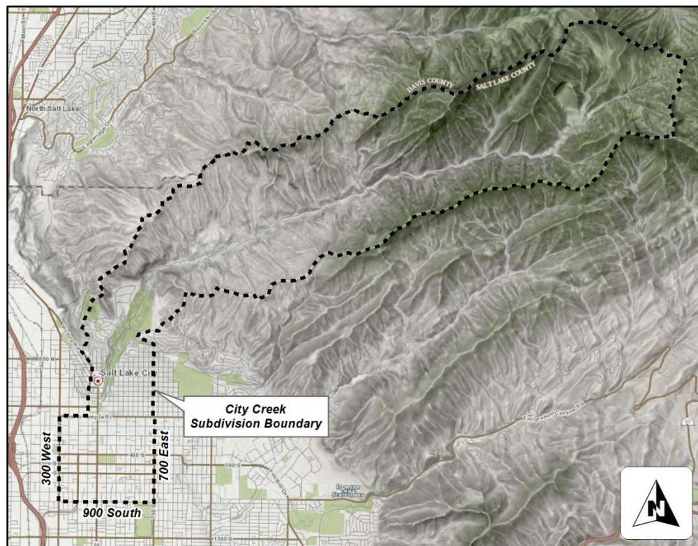
Figure 1: City Creek Subdivision Boundary

A search of our records indicates that you may be an owner (or owner's agent) of property or a water right within the boundary of the City Creek Subdivision. The City Creek Subdivision covers the area associated with the natural hydrologic drainage of City Creek, including a portion of urban Salt Lake City bounded on the south by 900 South, on the west by 300 West, and on the east by 700 East. (see Figure 1 below).