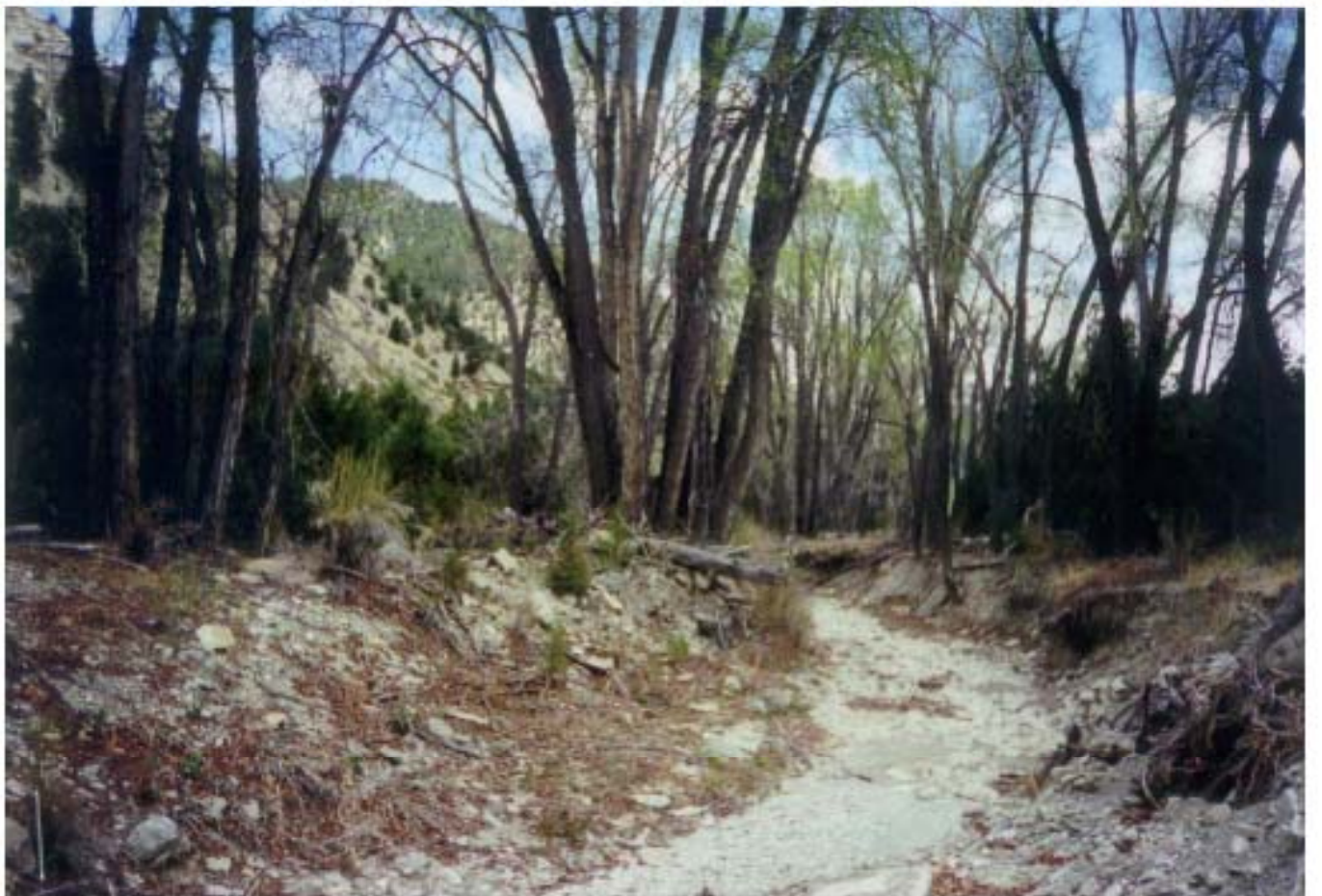
Summer 2002 Argyle Creek