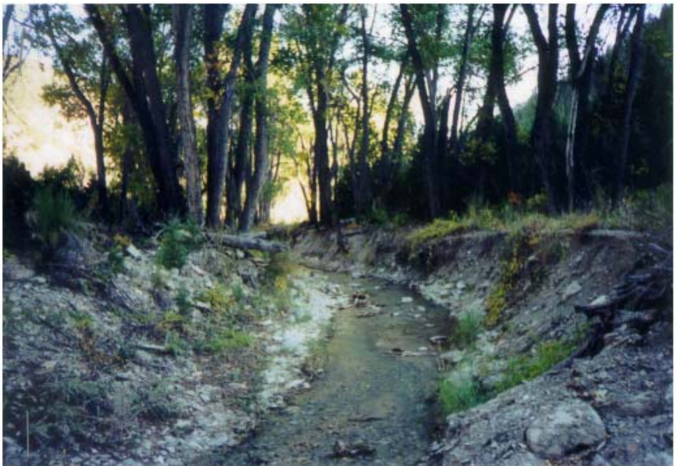
Summer 2001 Argyle Creek